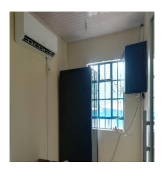
Figure 6: Well and safely installed servers and at controlled room temperature rating