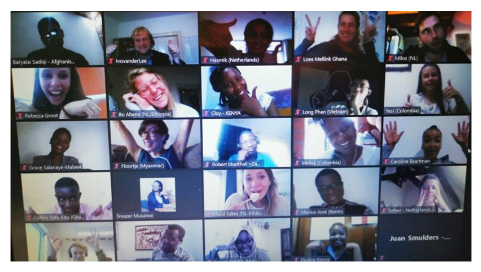
Figure 2: YEP BATCH21 during an online training