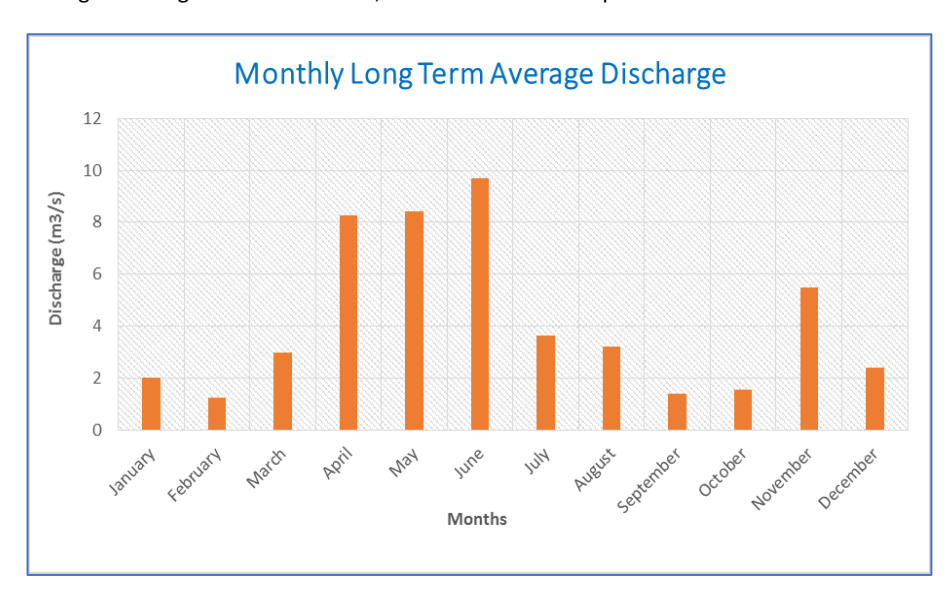
Figure 5: Long Term Monthly Average Discharge for RGS 4CB04, Thika River

competition for water resources increases. The graph below illustrates the long term monthly average discharge for station 4CB04, on Thika River for the period between 1948 – 2015.