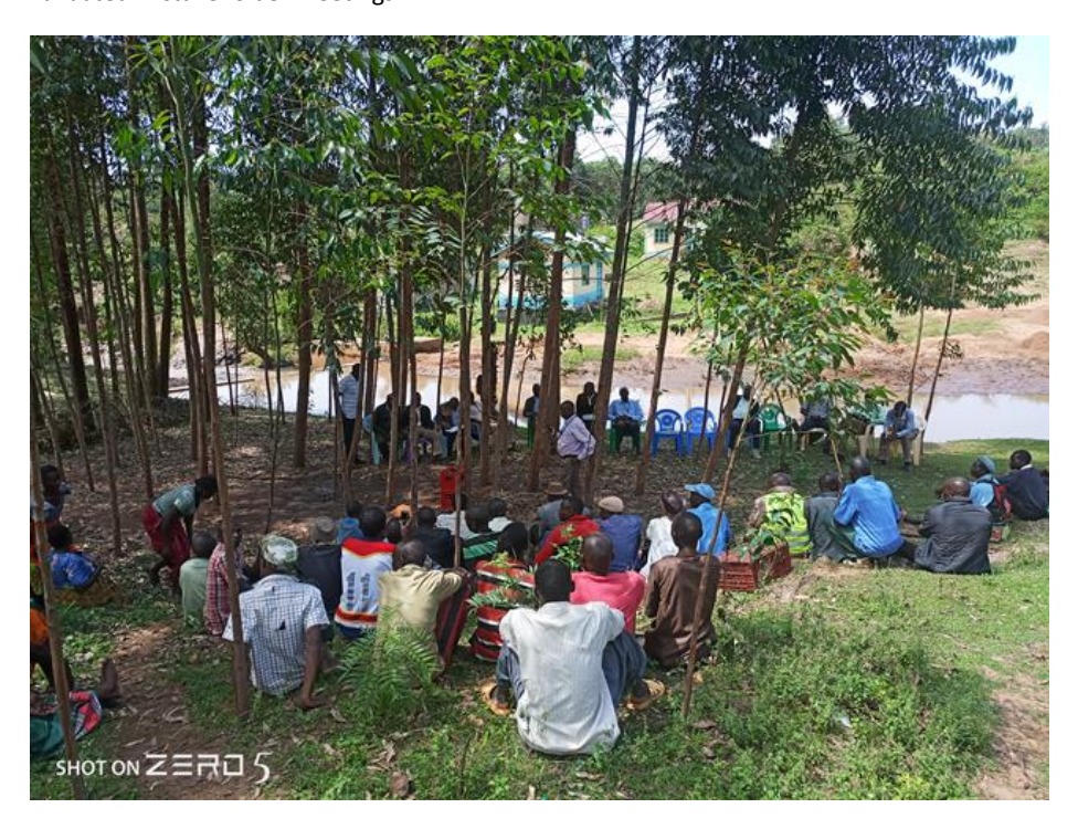
Figure 4: Example of stakeholder engagement in WRM

Once all the technical analysis is combined with the stakeholder input a Water Allocation balance proposal will be written. This proposal will be intensively discussed in stakeholder meetings with all stakeholders present. Once the Water Allocation Balance proposal is verified a draft Water Allocation Plan can be written. The draft Water Allocation Plan will again be validated in stakeholder meetings.